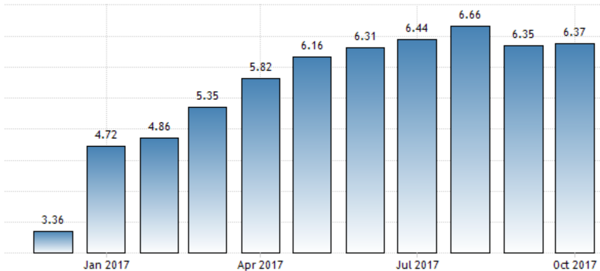
MEXICO INFLATION RATE